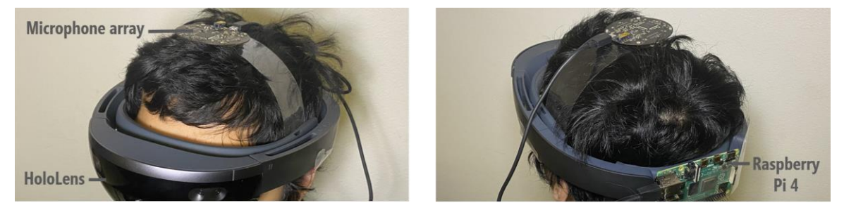
Figure 2: The three components of HoloSound system.

While not all DHH people want to use sound feedback technologies, past large-scale surveys with DHH people [3,4], show that many would find such technologies desirable and useful in everyday activities. HoloSound is informed by prior AR-based sound awareness work with DHH users [11,13,19], as well as personal ( e.g. , [12]) and research experiences ( e.g. , [15]) of one of our authors (Jain) who is hard of hearing. The system consists of two parts: an app running on the HoloLens and an external microphone array, ReSpeaker [20], retrofitted on top of the HoloLens (Figure 2). A cloud-based server is used to interface the portable microphone array with the HoloLens and to run the sound recognition engine. Figure 1 shows the preliminary user interface. Below, we detail the three key components of HoloSound, which are also demonstrated in the supplementary video. The system is open sourced on GitHub: <u>https://git.io/JJaHe</u>.