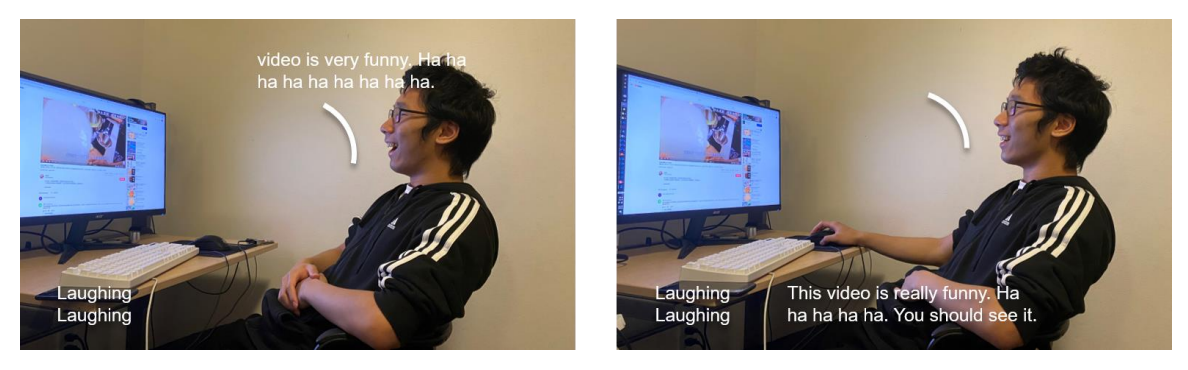
Figure 3: Speech-transcription can either be (A) placed on top of the speakers in the 3D space ( windows view) or (B) move with the user's head ( subtitles view).

For both views, the text scrolls up and disappears as the new transcription is appended. Users can also customize the transcribed text's font size (default: 0.75^{\circ} angular), the number of lines (default: 2), the width of each line (default: 60 characters), and the distance of captions from the eye (2m, 4m, 8m, or the default: projected onto background surfaces ( e.g. , walls) [14]). To stabilize jitter, the text block stays at the same location and smoothly drifts along when the user's head moves by at least 25°.